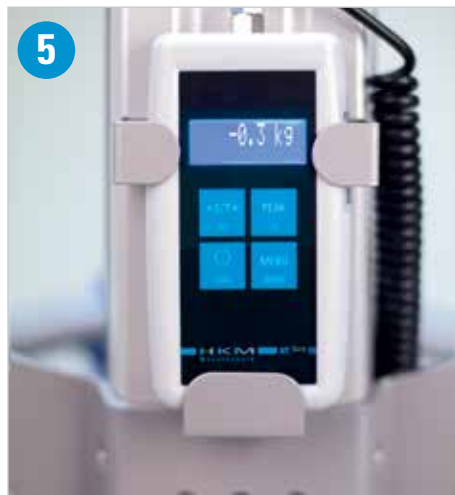
5 Optional: calibrated digital patient scale with auto-off feature.