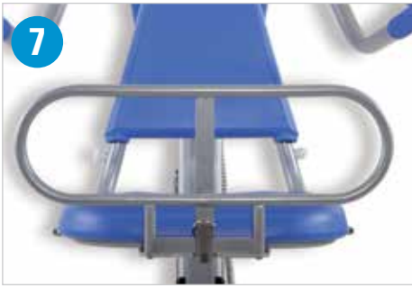
Optional: siderail with safety lock.