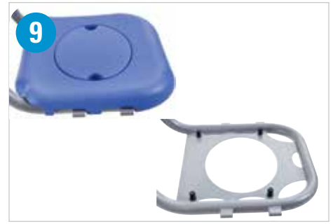
The PUR mattress can be simply pulled over the stainless steel frame and can be removed at any time.