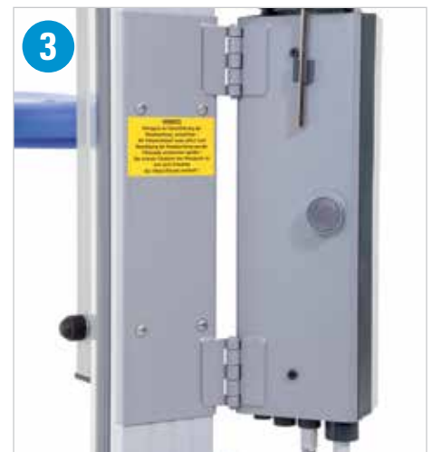
3 Battery tiltable to the side for narrow doors.