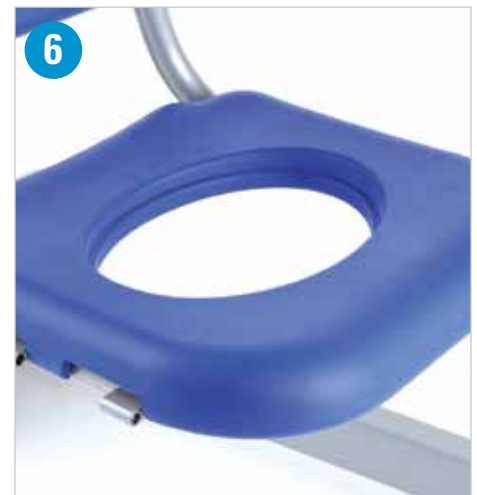
6 Seat with large hygiene opening, which can be covered.