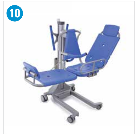
Optional: two removeable wings expand the seat lift effortlessly to provide a complete stretcher lift. An easy to insert foot rest is also included with the module.