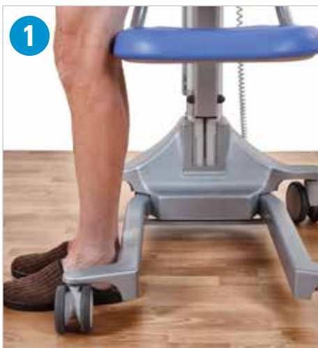
1 The special shape of the frame allows safe and easy self transfer.

Suitable for all standard nursing and care bathing tubs, electrical height adjustment, large hygiene opening, expandable to stretcher lift, tiltable battery, specially designed frame for easy transfer, easily moveable and sealed double castors, manual emergency lowering, ergonomical moving handles and many options.