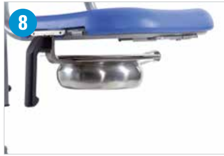
Optional: stainless steel bedpan with lid and holding support.