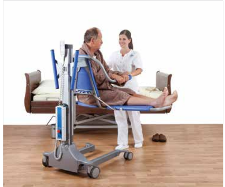
Fitting in with your care routine, you can pick up the resident directly from the bed.

Fitting in with your care routine, you can use our SENTA bathing lift to pick up the resident directly from the bed. The low frame fits under the nursing bed, allowing easy transfer from the bed. Alternatively the resident can also take the seat by himself, as the frame has been specially developed to allow this in a safer way.