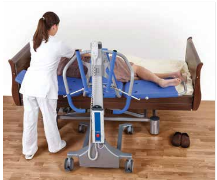
The low frame fits under the nursing bed and provides for easy transfer from the bed.