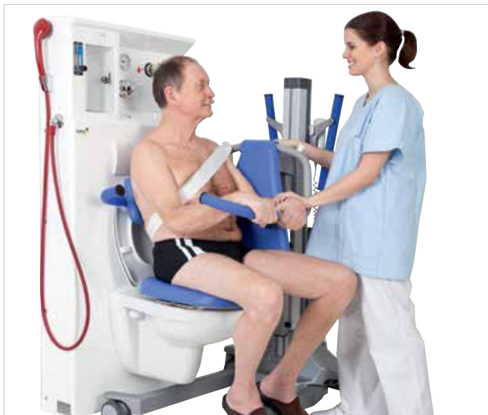
The SENTA lift has multiple uses. Its hygiene opening, which can be covered, makes it useable for visits to the toilet.

In option, a stainless steel bedpan with lid can be easily slid under the seat with a holding support.