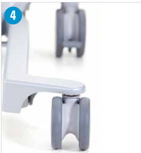
4 Sealed, easily moveable double castors. Rear ones lockable. Directional wheels also available.