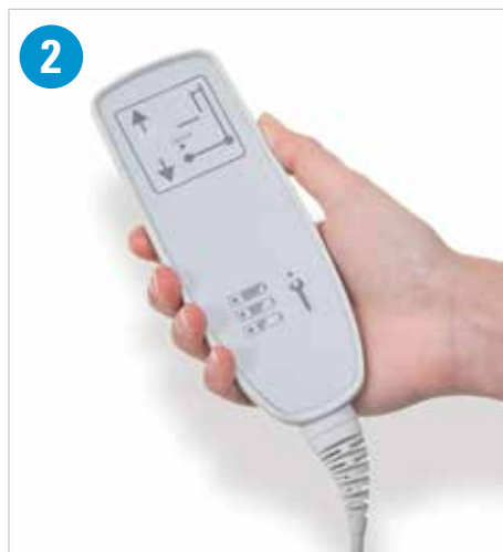
2 Hand remote control with error and service display, and permanent display of battery charging condition.