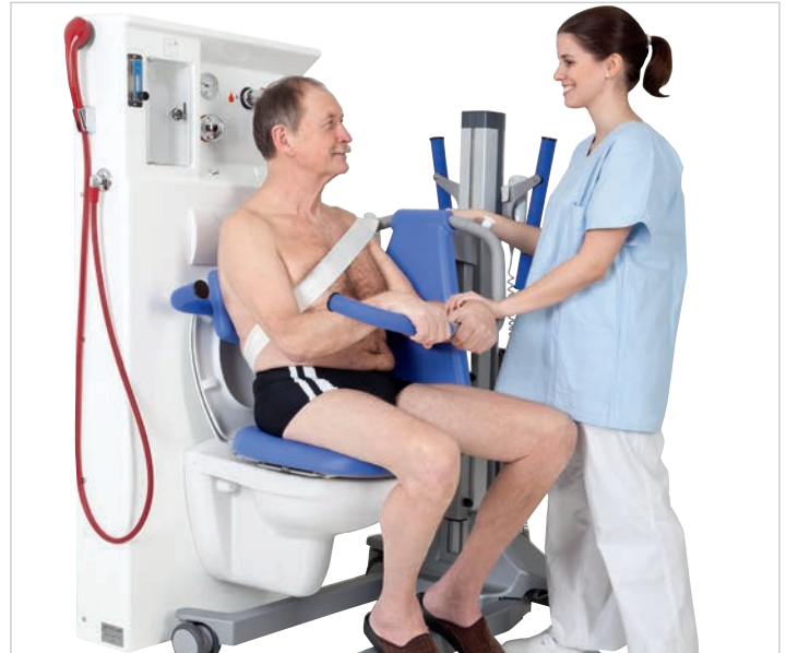
Easily used in combination with a seat lift for visits to the toilet.