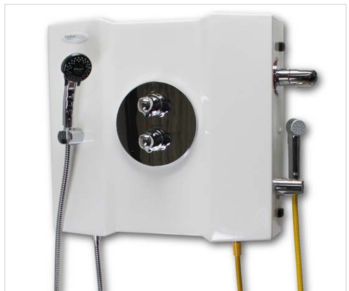
CPC1000 shower panel with disinfection system.